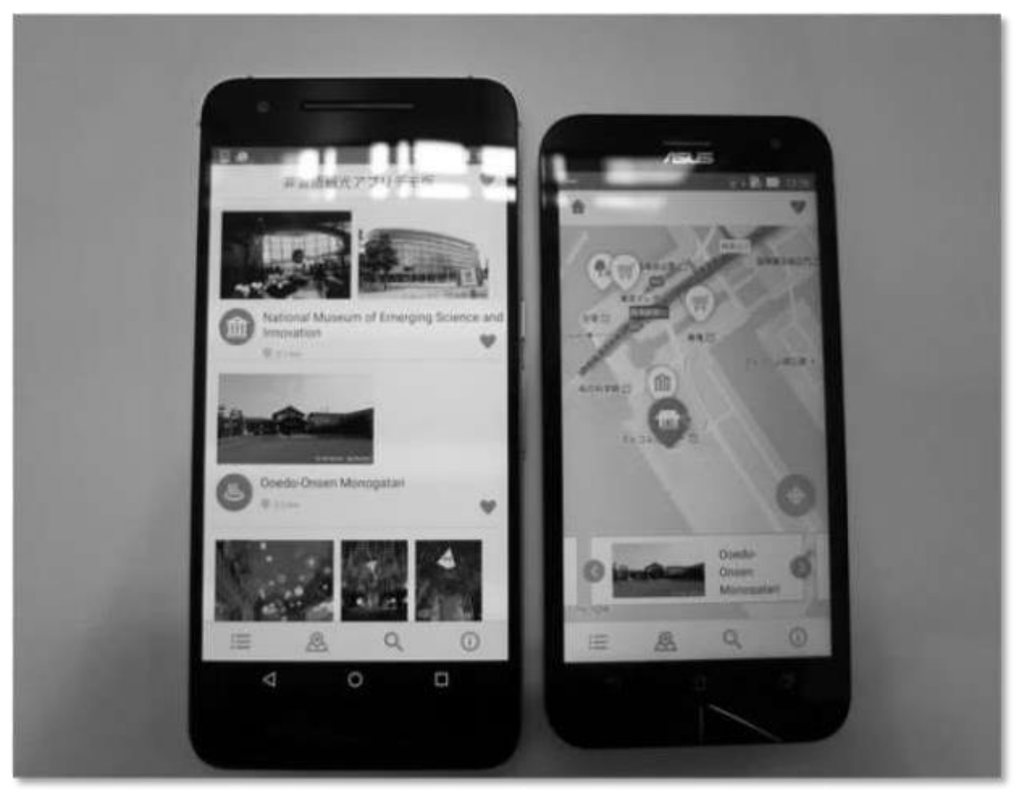
Figure 2: Prototypes